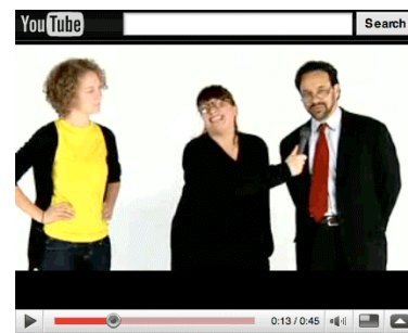
above: CUPE 3903 AD 1- Press